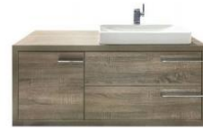
• Soft close vanity door