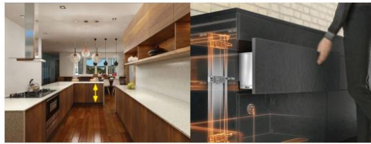
• Increased Kitchen Cupboard Height • 40mm Kitchen benchtop • Kitchen splashback