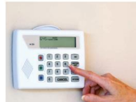
• Integrated Security Alarm system