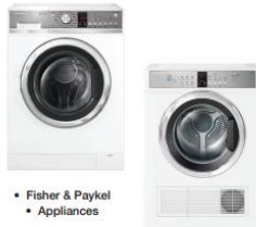
• Fisher & Paykel Appliances