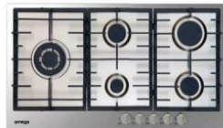
• 900mm Stainless steel 5 Burner gas cook top