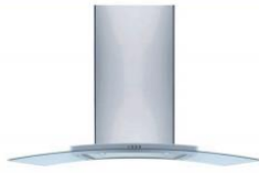
• 900mm High quality stainless steel canopy rangehood