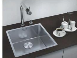
• Flush drop in-sink