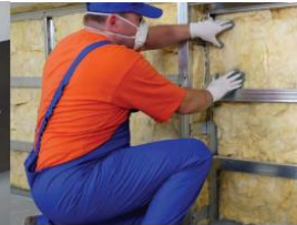
• Premium Insulation