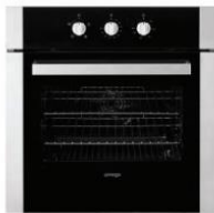
• 600mm Electric built-in oven